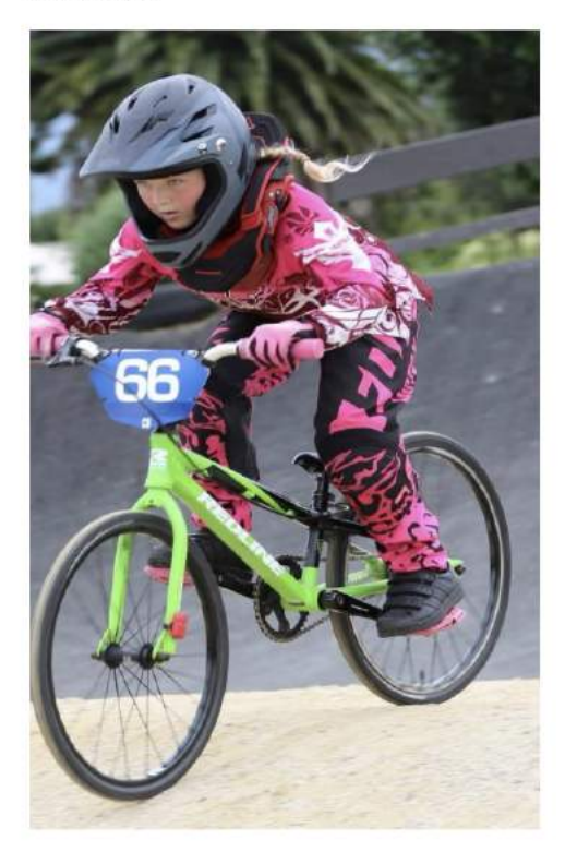
Contact Us: 125 Milton Street Leamington, Cambridge

Our only prerequisite is that riders can confidently ride a bike with no training wheels.